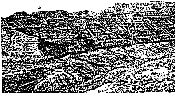
The barren-looking Deccan Traps, also known as the Deccan Plateau Basalts, are mountains and hills formed out of molten lava from a gigantic ancient eruption. The area covers a quarter of a million square kilometres in western India.

From the Globe and Mail November 26, 1988: "Two recent papers in the journal 'Nature' present new dating results on the Deccan Traps, which show that this enormous geological feature was formed at about the same time the extinctions of the Dinosaurs occurred". - catastrophic volcanism indicated.